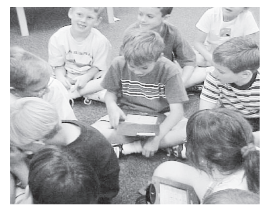
Figure 3. Expressing thoughts and opinions using an AAC device

Emphasis on communication skills development. The program's communication-based curriculum is specifically designed to support the development of basic language concepts, language structures and language use. As a result, students are given multiple opportunities to develop, understand and express language. Symbol/word-based intervention materials allow students to physically, auditorily and visually explore, understand and manipulate early language concepts and basic core vocabulary through literature, nursery rhymes, songs, and finger plays. Typical early childhood activities are chosen to provide opportunities for targeted communicative interactions throughout the day. Communicative expectations